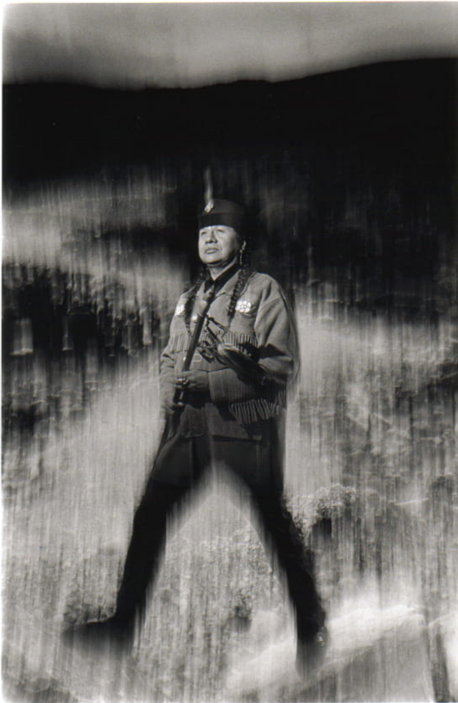
Stone Eagle Flies in to Roineabhal

the Free Church College all on the same platform – all that triple whammy – merited a single paragraph in the inquiry's multi-volume report.