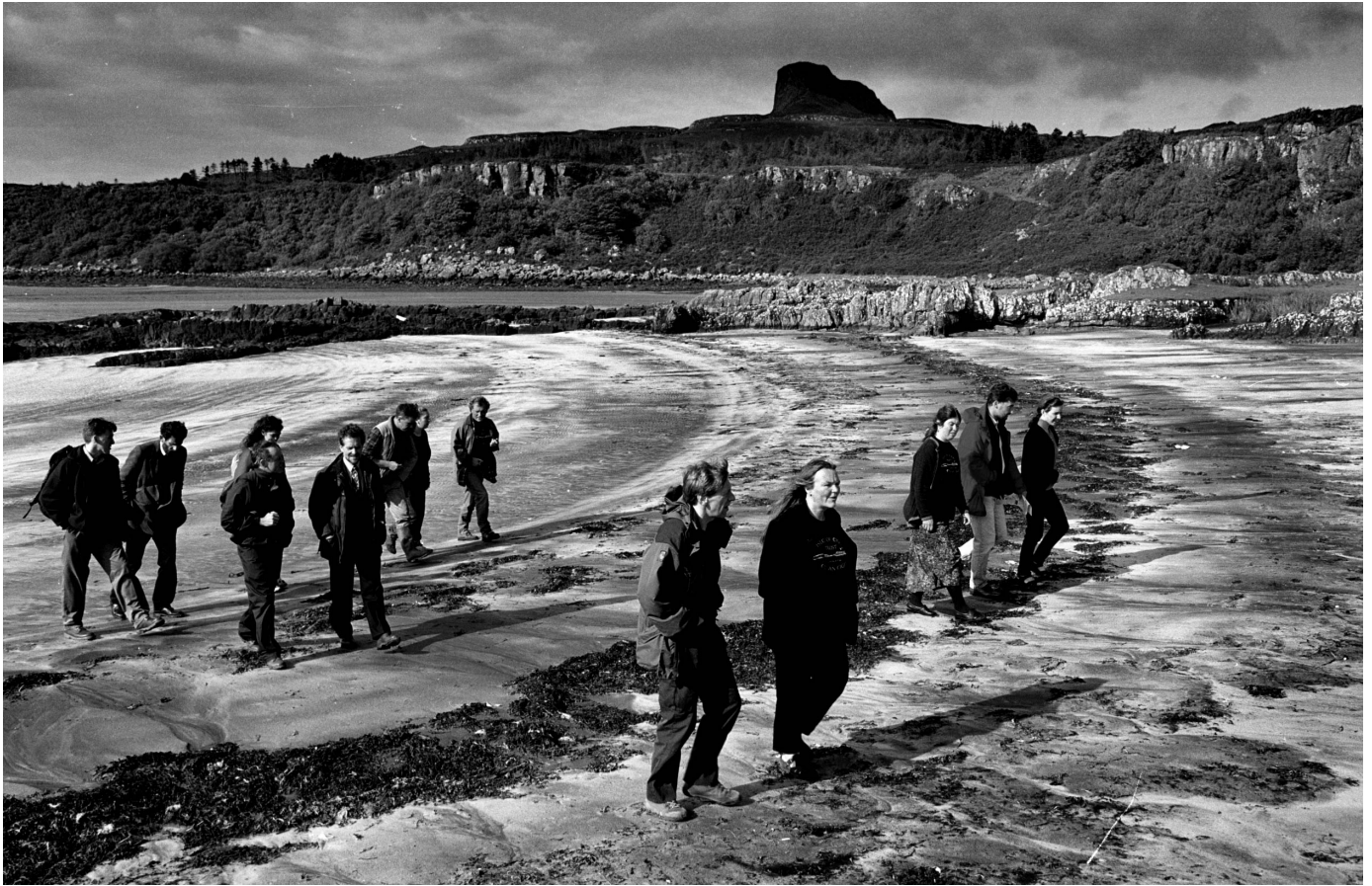
Eigg residents symbolically walk ashore to their own island, Independence Day, 12 June 1997

generation to take the final steps. Theirs is the future for the making. Theirs to choose, “What will we leave ...?”